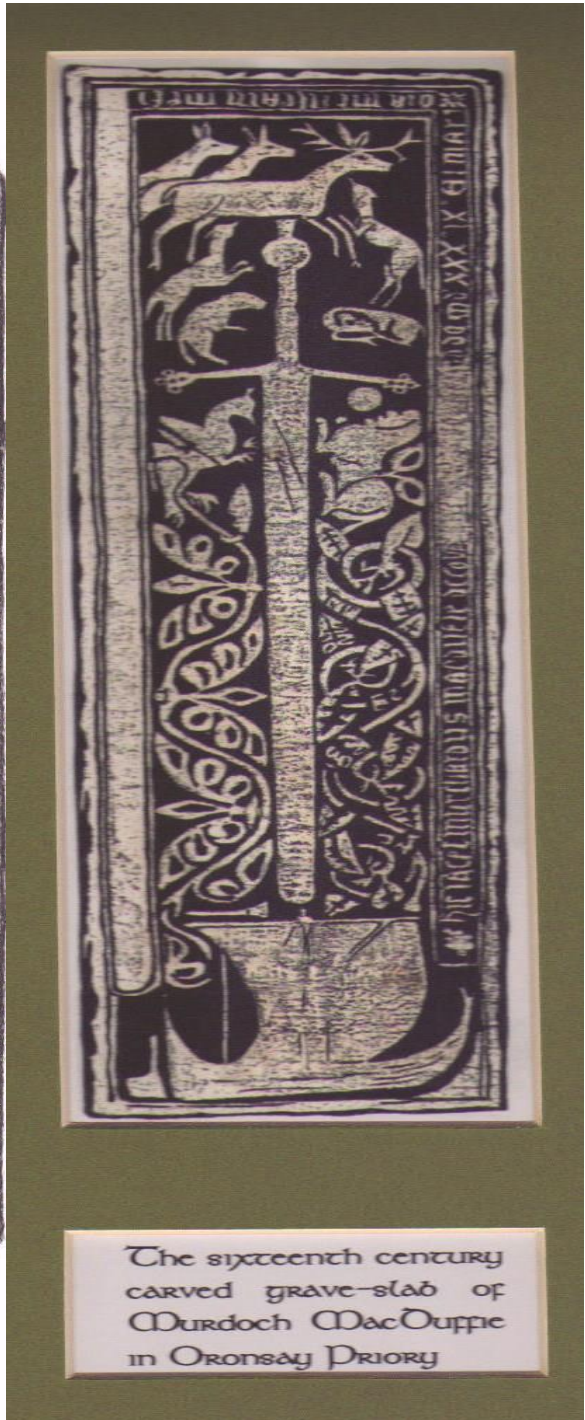
Pictured on the cover page are the stylized version of Murdoch MacDuffie's Grave Slab and an actual picture of the slab on Oronsay. The actual carving is "MacDufie" from the mid 1500s.