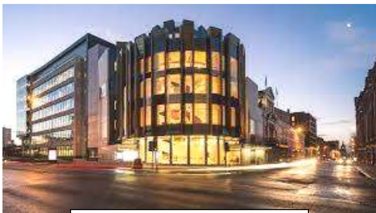
Theatre Royal Glasgow