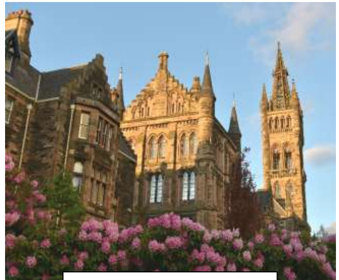
University of Glasgow