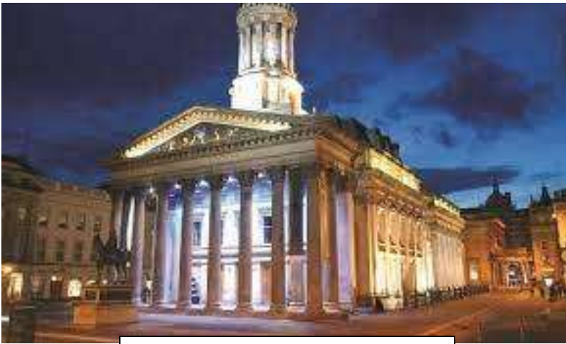
Museum of Modern Art

With the selection of a new Clan Commander, our Society, as well as our worldwide Clan Societies, is looking forward to becoming more active, post Covid, and running more Clan events in the coming year.